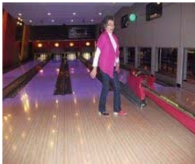
Oh!Oh! The Gate was still down! You want me to pick this up???