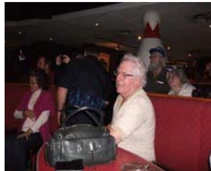
Yup!!! I can do that- sounds good!