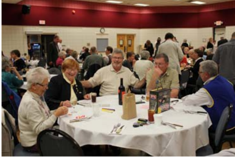
Reverse Raffle 2010